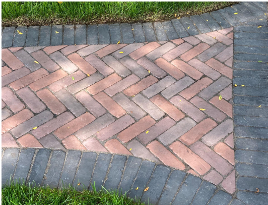
Herringbone pattern example