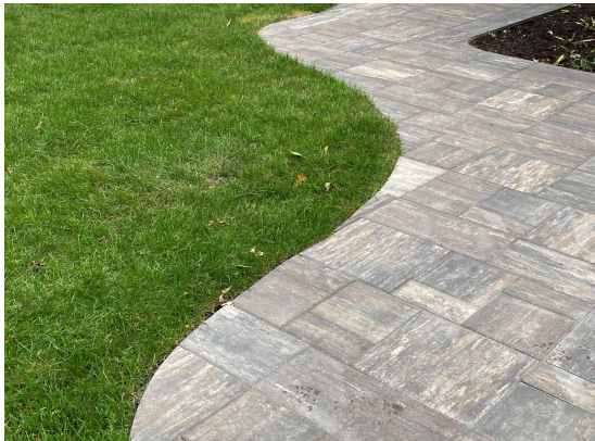
Patio with curves example